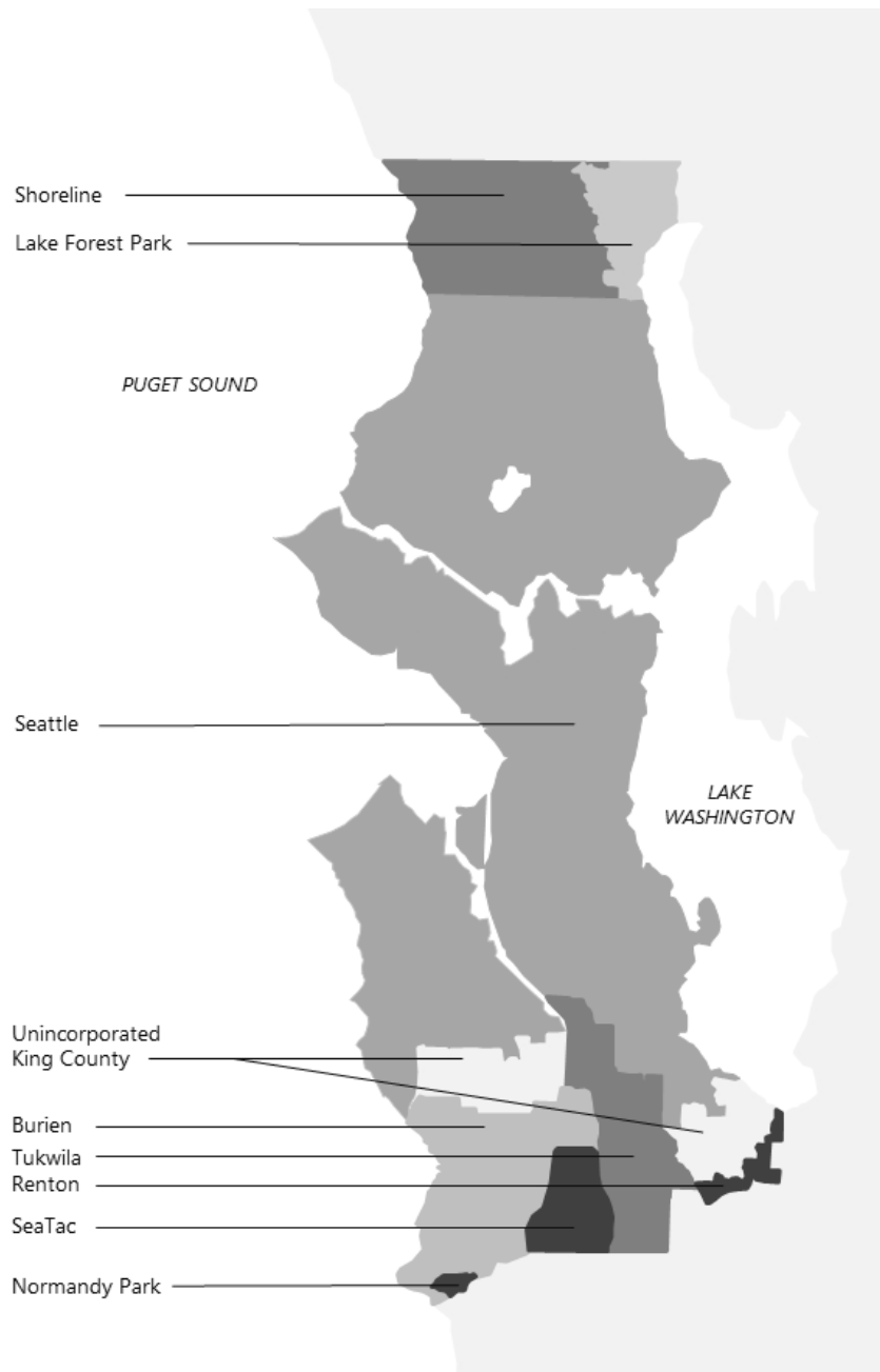
FIGURE 1: SEATTLE CITY LIGHT DEPARTMENT'S SERVICE AREA MAP

Source: Seattle City Light Department, Financial Planning Unit